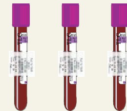
Tube #1 Tube #2 Tube #3

Store samples at 1°C to 10°C. Do not freeze.