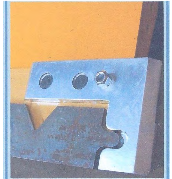
(Above): Left-Side (MAG-500) Carbide Casting End Guard with Maximum-Duty Attachment Bracket. End Guards are Manufactured with Various Degrees of Wear-Angle Depending on Customers Needs.

Above: Oklahoma Turnpike Authority (OTA) 12-ft MHL Interlocking (MAG/500) Snow Plow Blade with Right-End Guard