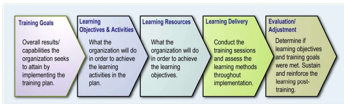
The High-Level Training Process Phases

In the development of content, Persimmon leverages a proprietary instructional design methodology - the FIRM Model - that provides the basis for effective learning. When developing learning content, Persimmon first seeks to define the strategy that establishes a framework of the planned training approach. This may be very concise for a single course, or extensive for a long-term learning and development program. It identifies the training needs, deployment strategy, and resources needed for successful training and knowledge transfer. Throughout the life cycle of the learning process, Persimmon leverages the five phases outlined in the figure below for the development, delivery, and assessment of the learning.