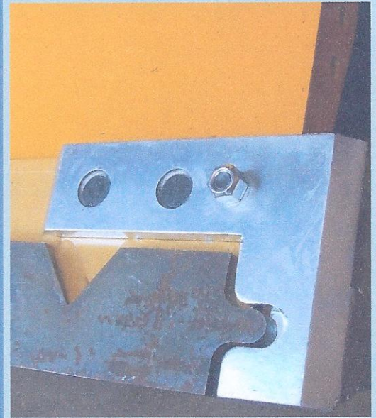
(Above): Left-Side (MAG-500) Carbide Casting End Guard with Maximum-Duty Attachment Bracket. End Guards are Manufactured with Various Degrees of Wear-Angle Depending on Customers Needs.

Above: Oklahoma Turnpike Authority (OTA) 12-ft MHL Interlocking (MAG/500) Snow Plow Blade with Right-End Guard