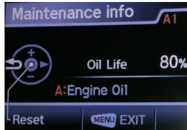
Honda Civic (0w20)