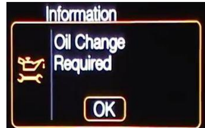
Ford Focus, Escape, Fusion (5w20)