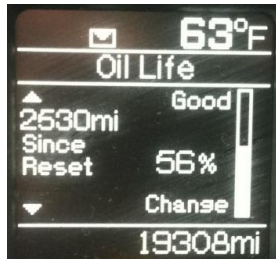
RAM/Caravan (5w30 / 5w20)