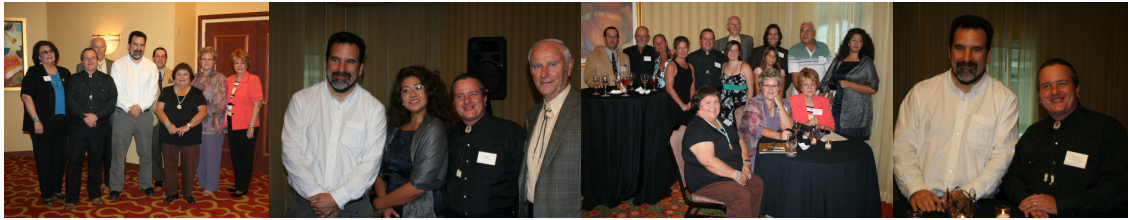
Pictures are from the reception hosted by the Delaware Nation to welcome the Suquamish Tribe of Washington state to Oklahoma, as a part of their strategic "historical" partnership. (SEE LIAISON, July Edition, 2008) Below is a follow-up story of that event.