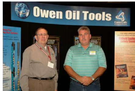
Owen Oil Tools

Norris Rods Odessa Separator, Inc. Oilfield Improvements, Inc. Oklahoma Environ., Inc. OPECo, Inc.