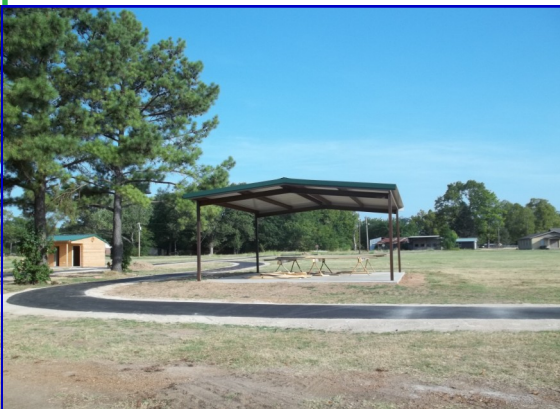
Antlers Walking Trail

gathering endorsements for policy change and program development. They feel they can promote healthy living by providing access to healthy fruits and vegetables and promoting and implementing physical activity environments and opportunities in schools, communities, workplaces and businesses by modeling the example they have established through their accomplishments in over the past two decades.