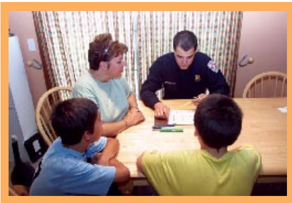
Figure 3: A family makes a home escape plan.

A home escape plan is your way out of your home if you have a fire. After you plan your escape, all family members should practice the escape plan every six months. The more you practice your escape plan, the more prepared you will be to take action in an emergency.